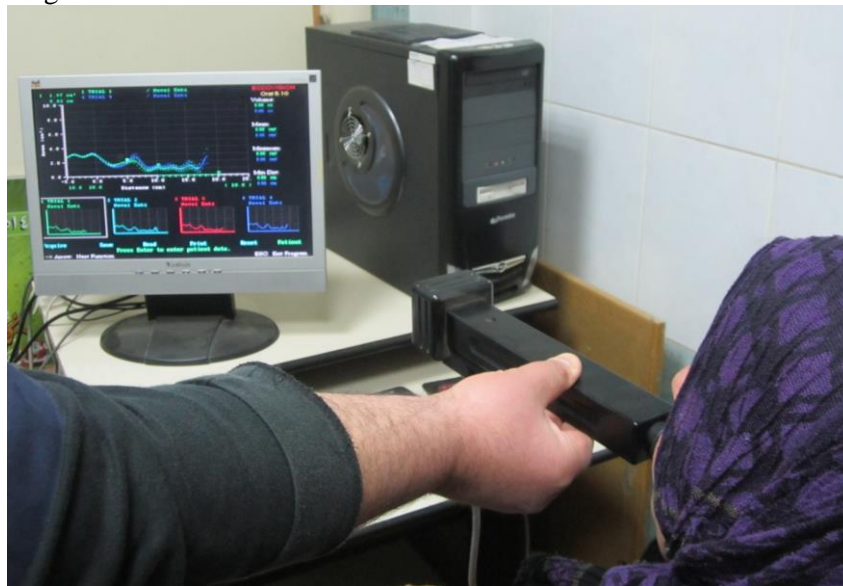
Fig(1): Acoustic pharyngometry examination (Benha Teaching Hospital, ENT department, 2012).

Procedure of acoustic pharyngometry: The device used was acoustic pharyngometer [E. Benson Hood Laboratories, Pembroke, Mass. USA]