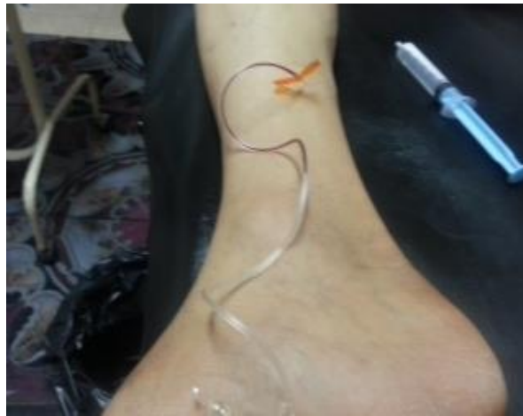
Cannulation of below knee LSV