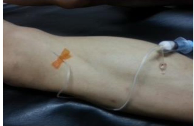
Patient with LSV reflux