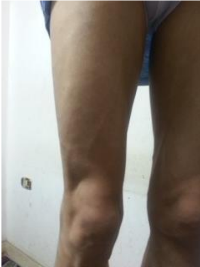
Patient with LSV reflux